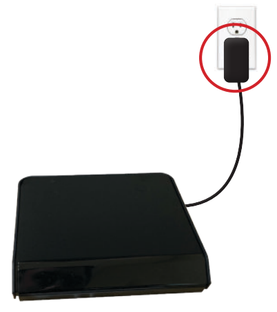
Modem (only one model shown here)

Plug in the power adapter to the modem and the other end into the wall socket. The modem's power light should turn on.